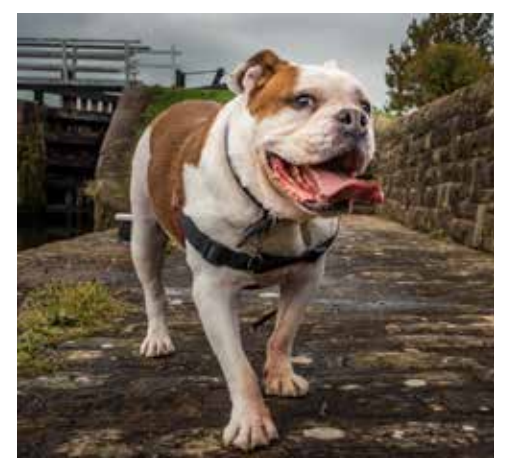
We are often asked "how does it all work?" below is dog rescue in a nutshell!

We are all volunteers - Aireworth Dogs In Need (ADIN) has no paid staff and everyone involved has other commitments; work. family etc and rescue activity is squeezed in amongst our "real lives"!